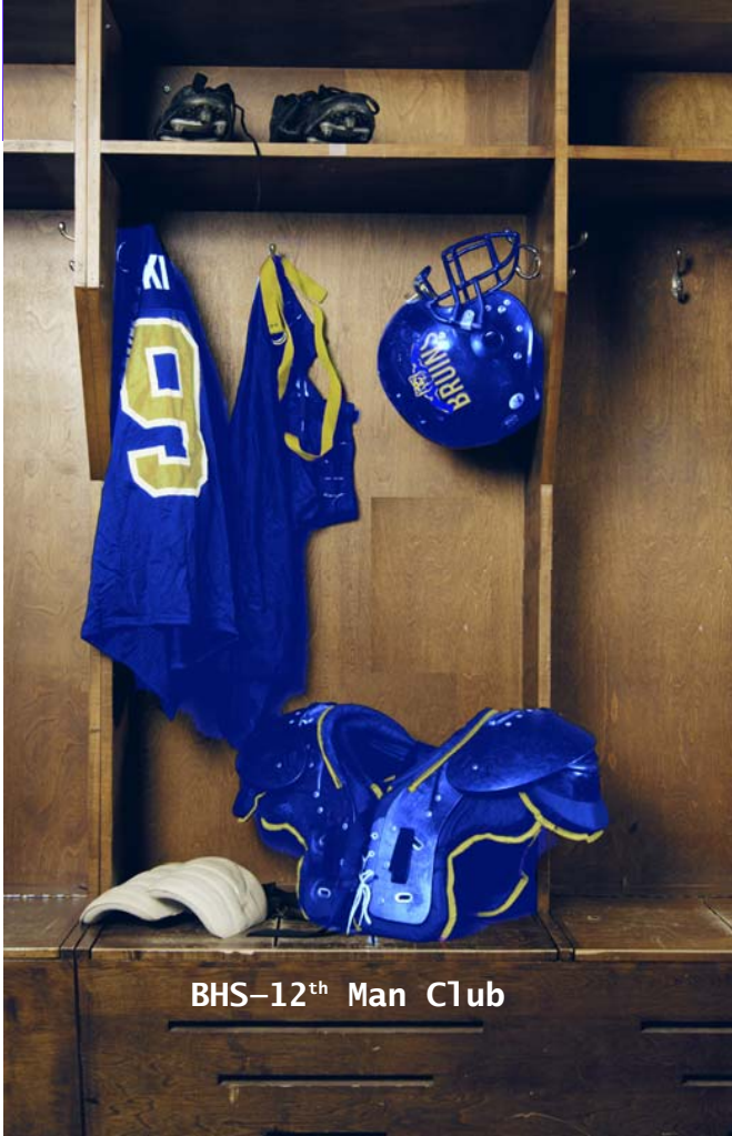
BHS-12 th Man Club